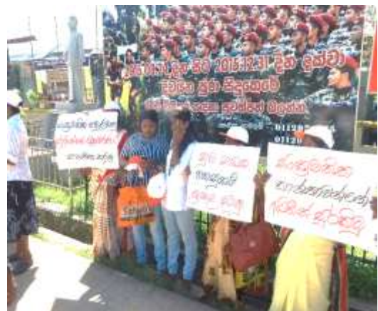
Migrant workers’ day in Galle

Several issues were highlighted relating to the implementation of the FBR. The indicated child care arrangements are not always resulting in the needed care and a proper guardian. The FBR does not provide an effective system and a mechanism to provide government services to the families of migrant women including